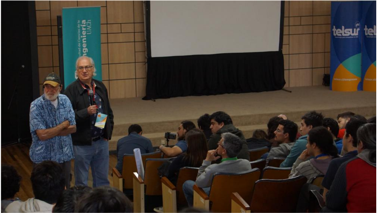
Questions time at the end of his first plenary talk at EVIC 2019