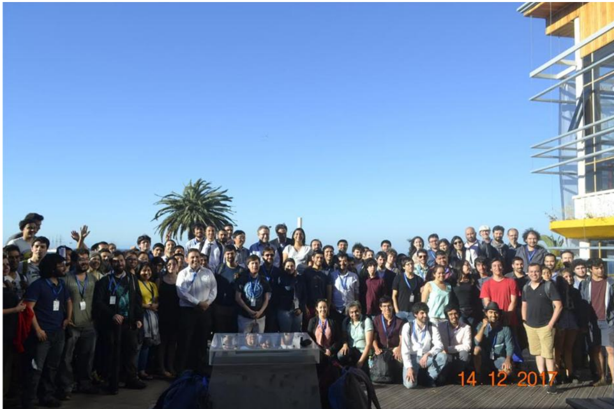
Group picture with several of EVIC 2017 participants. It was taken at the terrace where the poster competition prizes were handed out, and also where the coffee breaks took place. We were happy not only with outcome of the school, but also with the weather. At the left, far in the back, you may distinguish the four masts of the Esmeralda, the school ship of the Chilean Navy, at the port.