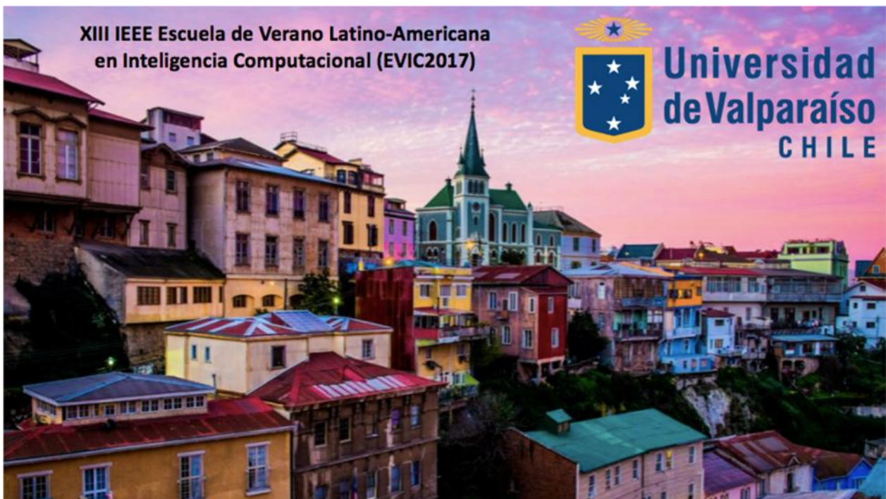
Poster of the XIII Latin-American Summer School on Computational Intelligence, held at Universidad de Valparaíso, on December 13th to 15th, 2017.