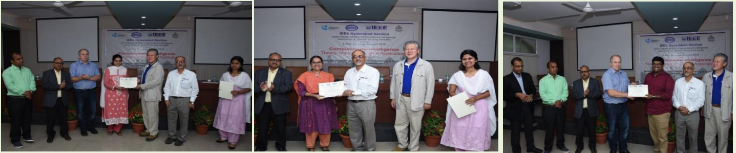
Certificate Distribution @ valedictory function

Finally, certificates of participation were presented to all participants. Day- wise feedback and an overall event feedback were taken by the participants through Moodle services. It has been excellent and were asked to organize more such events in the future.