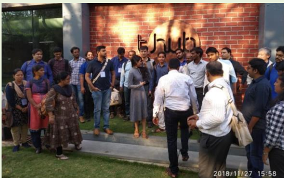
Participants @ t hub, Hyderabad

All the sessions were highly interactive, lively and interesting and credit goes to all the participants and the speakers.