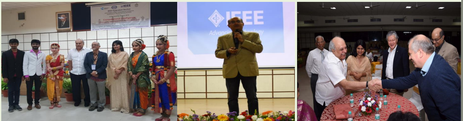
Resource persons, Students, IEEE CIS Chapter Execom Members, Dignitaries from MJCET and IEEE Hyderabad Section Officials @ Cultural Program

A banquet dinner and a cultural program were organized on the theme of Indian cultural. Students performed traditional dance like Bharatanatyam, Kuchipudi and Instruments which made the evening a memorable one.