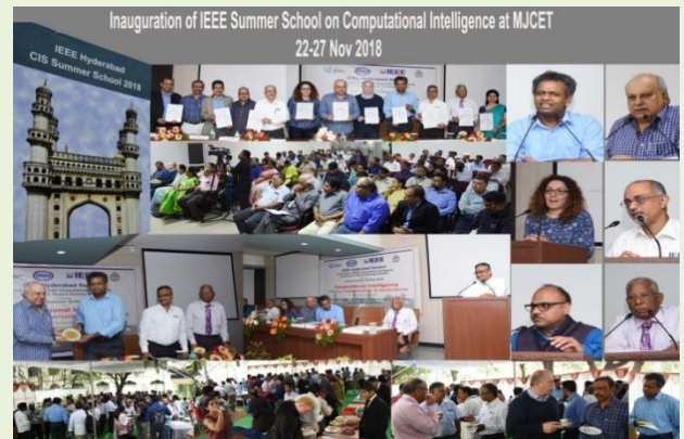
Glimpses of the Inaugural Ceremony